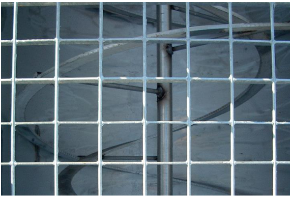
1. Double cross flow